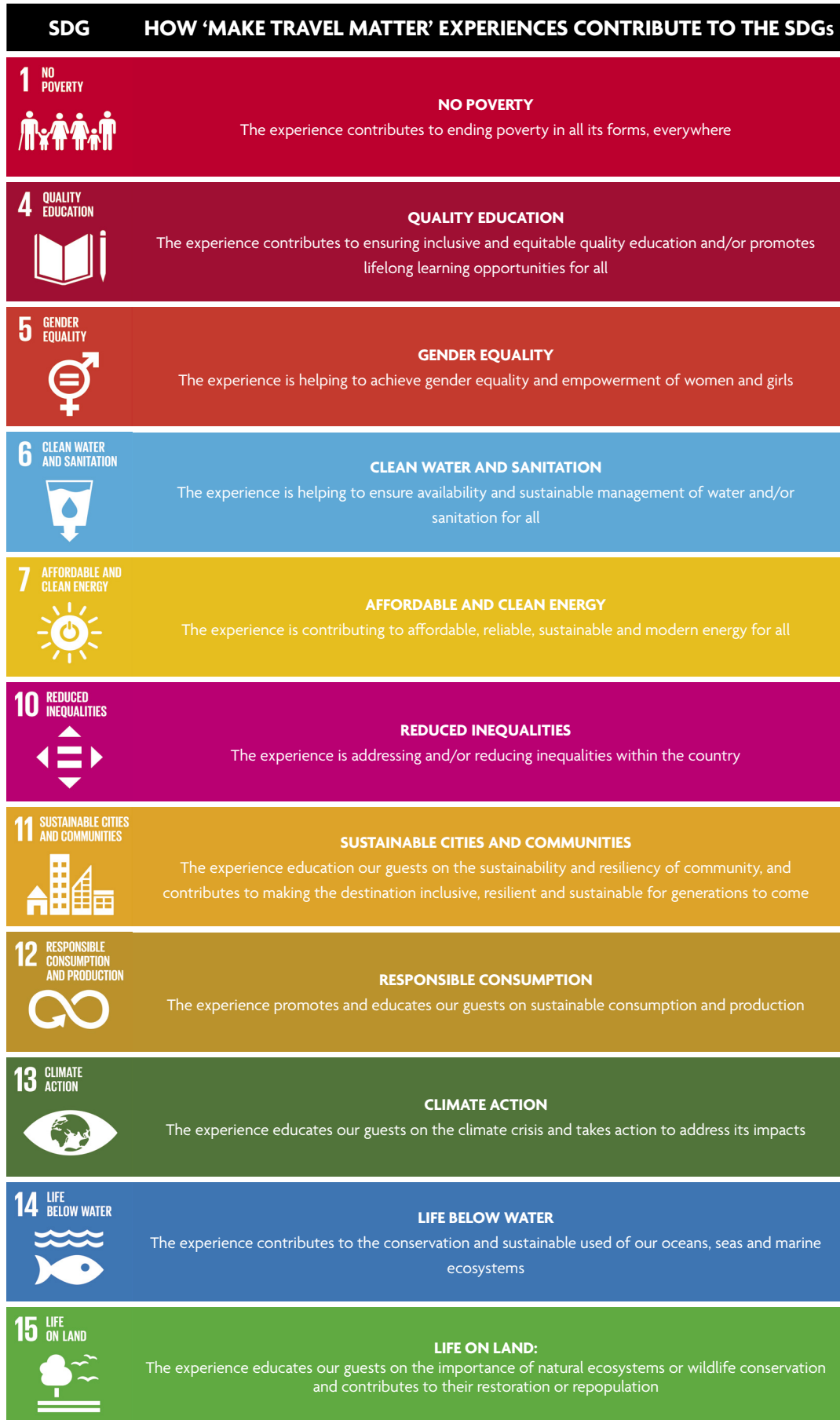
TABLE 1: MAPPING 'MAKE TRAVEL MATTER' EXPERIENCES TO DELIVERY OF THE SDGs

Adapted from https://ttc.com/wp-content/uploads/2019/12/MTM-Qualifying-Experiences.pdf