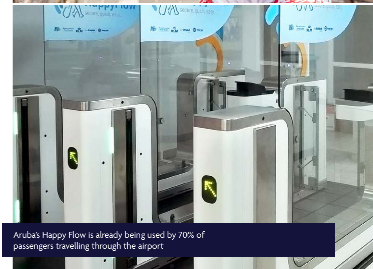
Aruba's Happy Flow is already being used by 70% of passengers travelling through the airport