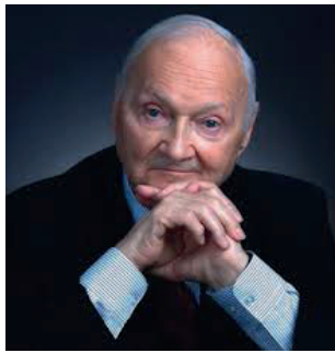
MAURICE F STRONG 1929-2015

"Today the world mourns one of its greats. Maurice Strong was a visionary and a pioneer of global sustainable development."