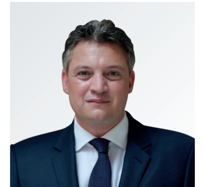
KONRAD MIZZI Minister of Tourism Malta

With these measures and this Annual Report, which we are delighted to see co-published with the influential World Travel & Tourism Council, Malta is signalling its intention as a small island state, with a big tourism economy, to also be a climate friendly travel leader.