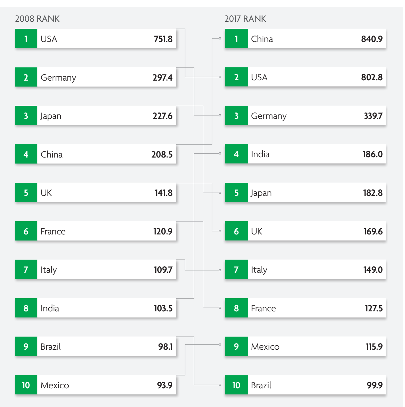
Chart 1: Countries' positions in domestic visitor spending (2008 and 2017) (Travel & Tourism Domestic Spending, in 2017 US$bn real prices)

Germany ranked third in domestic spending in 2017 with US$340 billion, nearly double the amount of India and Japan, which came fourth and fifth with US$186 and US$183 billion respectively. It is worth noting the rapid development of the domestic Travel & Tourism market in India, which grew by US$83 billion and rose from the eighth to the fourth largest domestic market between 2008 and 2017. Unsurprisingly, the largest developed countries dominate the top spots in terms of absolute size of domestic spending.