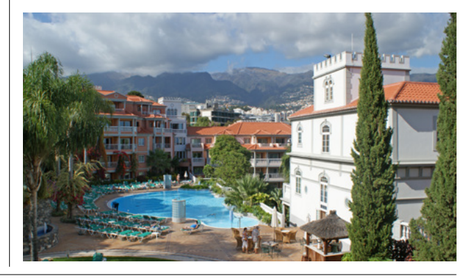
Hotel Investment Best Practices

The Tourism Training Talent (TTT) programme has been acknowledged by UNWTO as an example of innovation and excellence for its dedication to the training of future generations of Travel & Tourism professionals<sup>43</sup>. This investment in training is paying off in the medium to long term, with hotel investors attracted by the prospect of a well-trained and reliable workforce. Overall Travel & Tourism investment is forecast to soar by an average 9.4% a year over the next ten years.